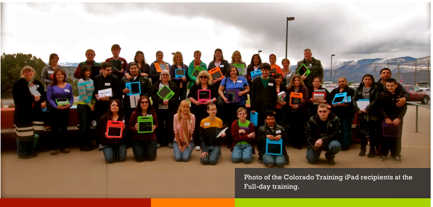
Photo of the Colorado Training iPad recipients at the Full-day training.

*May be considerably less with in-kind donations of food, location fee, printing, etc. Wherever possible we try to work with local businesses to secure in-kind donations.